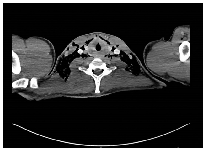
Figure 2 CT showing epidural emphysema and surgical emphysema in the soft tissues of the neck.

The pathogenesis of pneumomediastinum in DKA is multifactorial. Kussmaul's breathing, the respiratory compensation mechanism in metabolic acidosis,