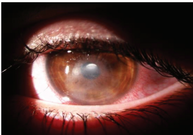
Fig. 2 After 3 weeks