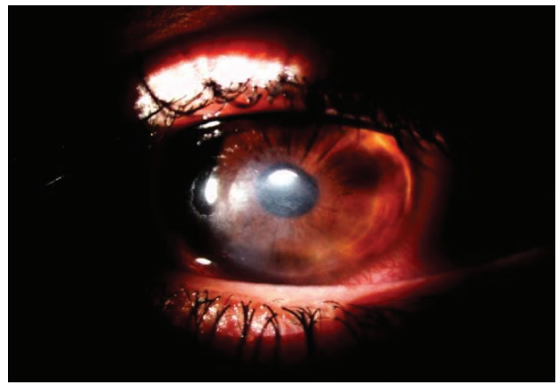
Fig. 3 After 3 months