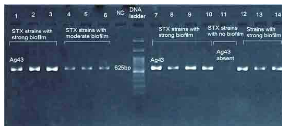
Fig. 2. Agarose gel electrophoresis of PCR product of amplified antigen 43 autoadhesin gene detected in non-O157 STEC isolates from animal and human origins. Lanes 1 to 14 indicates strain numbers. DNA marker was consisting of a ladder with 100bp. Electrophoresis was conducted in 1.5 % agarose gel.