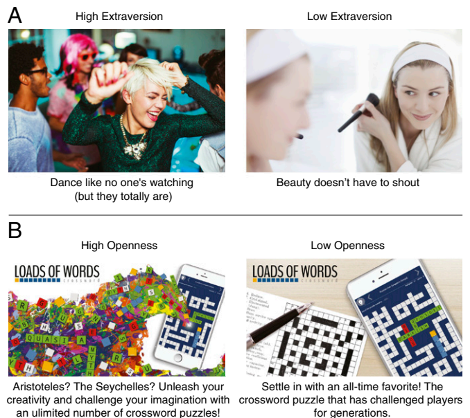
Fig. 1. Examples of ads aimed at audiences characterized by high and low extraversion (A) as well as high and low openness (B). Fig. 1A, Left courtesy of Caiaimage/Paul Bradbury/OJO+/Getty Images; Fig. 1A, Right courtesy of Hybrid Images/Cultura/Getty Images.

Study 1 demonstrates the effects of psychological persuasion on people’s purchasing behavior. We tailored the persuasive advertising messages for a UK-based beauty retailer to recipients’ extraversion, a personality trait reflecting the extent to which people seek and enjoy company, excitement, and stimulation (18). People scoring high on extraversion are described as energetic, active, talkative, sociable, outgoing, and enthusiastic; people scoring low on extraversion are characterized as shy, reserved, quiet, or withdrawn. Given the specific nature of the product, we only targeted women. Fig. 1A displays 2 (out of 10) ads aimed to appeal to women characterized by high versus low extraversion (we refer to the personality of the audience an ad is aimed at as ad personality ). Using a 2 (Ad Personality: Introverted vs. Extraverted) × 2 (Audience Personality: Extraverted vs. Introverted) between-subjects, full-factorial design, we ran the Facebook