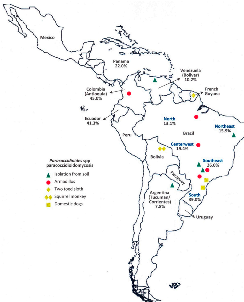
Figure 1. Rate of the Paracoccidioides spp. infection determined by intradermal test in general populations according to geographic area [7,31,38,56,57,59–63]. Comparatively, the marks show the places where this fungus was isolated from soil [4] or where captured animals have paracoccidioidomycosis: armadillos [8,9], two-toed sloth [73], squirrel monkey [72], and domestic dogs [70,71].

Intradermal and serological tests conducted on domestic and free or captive wild animals have revealed that various mammals and birds may be infected with Paracoccidioides spp. [66–68]. It was observed that the rate of infection is higher in dogs from the rural area than in dogs from the urban zone and higher in rabbits raised free than in caged animals [66,69]. Part of the animals reacting to the tests was sacrificed and Paracoccidioides spp. was not detected in their viscera, suggesting effective control of the fungal infection [69]. On the other hand, there are reports of paracoccidioidomycosis-disease among domestic dogs living in the Brazilian Southeast and South [70,71]. With the exception of armadillos [8,9], this fungal disease was rarely observed in the other wild animals: a squirrel monkey [72], and a two-toed sloth [73] (Figure 1).