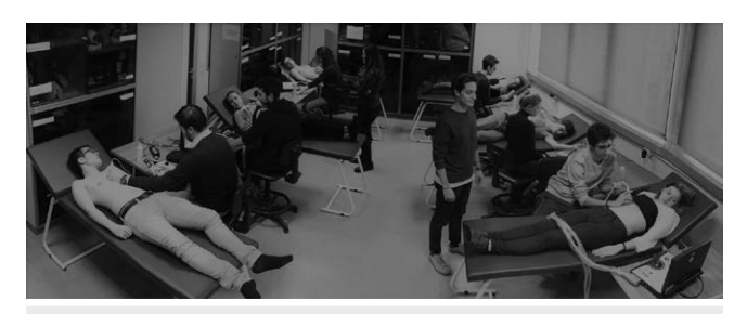
Fig. 1 A group of twelve peer learner, assisted by peer tutors

The present study shows an innovative didactic path that culminated in the exam test which assigned one credit in the core cur-