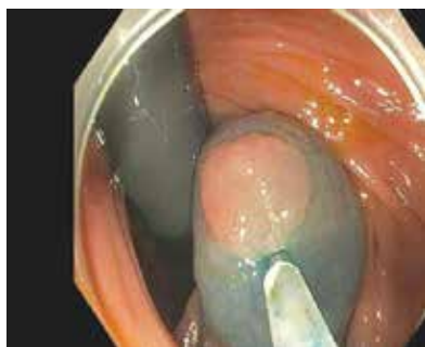
Figure 7. The same lesion after a submucosal lift using a viscous agent with methylene blue.