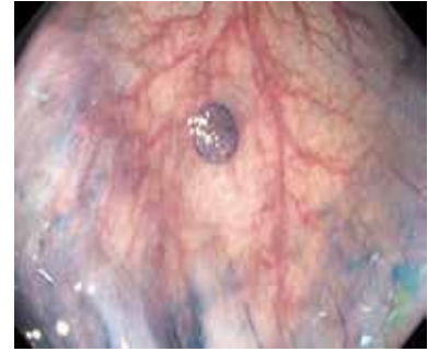
Figure 11. This 3-mm sessile polyp (Paris class Is) in the sigmoid colon demonstrates avid uptake of methylene blue. The blue dye highlights the overall lesion and also provides pit pattern staining to differentiate polyp subtypes.

with gas; carbon dioxide is preferable because it is more comfortable for the patient. 35 An endoscopist must be trained to find the subtle flat polyps that are difficult to see and to look carefully behind all the folds and flexures of the colon. Optimal bowel preparation is key.