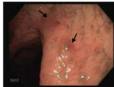
Figure 4. This 2-cm, flat serrated polyp (Paris class IIb/Is) has a focal sessile region of dysplasia in the right center. Note the broad, flat area left of the lesion with slight erythema and loss of vascular markings.

of screening for CRC. 13 Given the important impact of CRC screening on survival, there has been a major focus on increasing screening among the eligible population. The National Colorectal Cancer roundtable has a public relations campaign, known as “80 by ’18,” which reflects the goal of achieving an 80% rate of screening among eligible patients by 2018. 14 To achieve this goal, physicians and other healthcare providers must consider how to encourage patients to undergo colonoscopy. One of the most important ways is to emphasize the benefits. Among all of the cancer prevention strategies (eg, mammography, Pap smears, prostate screening, lung cancer screening), colonoscopy is probably the most effective. However, many people are still averse to the procedure, primarily because of the bowel preparation. Some people find this requirement embarrassing, difficult, and/or uncomfortable. In reality, bowel preparation formulations have become much easier to use. There are now low-volume bowel preps and so-called split-dose bowel preps. 15,16 The dietary restrictions required for the day before a colonoscopy have also become less strict. In the past, patients had to adhere to a clear, liquids-only diet. There is now good evidence that low-residue foods, such as milkshakes and smoothies, are fine. Lastly, sedation has greatly improved,