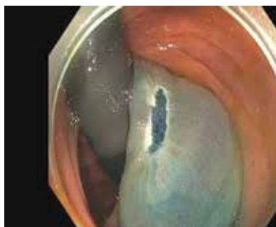
Figure 8. The same lesion after en bloc resection, with clear lateral margins.

Polyps that exhibit high-grade dysplasia are more likely to become malignant over time (if not removed). 19 Shape is another risk factor, with the highest likelihood for malignancy found in polyps that are flat, particularly those with a central depression. 20