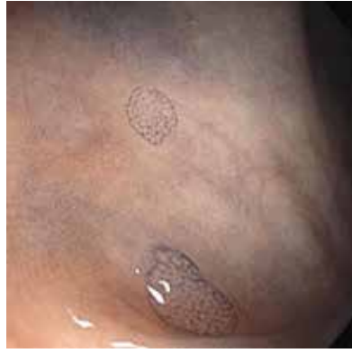
Figure 10. Two diminutive flat lesions are highlighted with methylene blue chromoendoscopy. Note the avid uptake of methylene blue by the polyp in contrast to the minimal uptake by the surrounding normal mucosa.