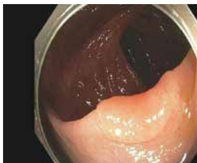
Figure 6. A 1-cm flat lesion in the ascending colon with a slight central depression.