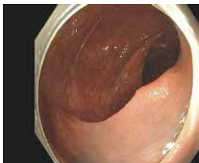
Figure 5. En bloc removal with endoscopic mucosal resection.