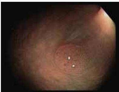
Figure 3. This 6-mm sessile polyp was removed (not shown) by cold snare polypectomy. The histology was tubular adenoma.