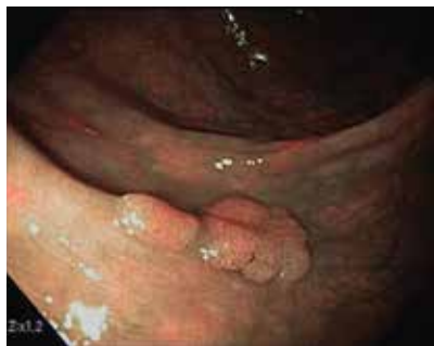
Figure 2. This 1.2-cm lateral polyp (Paris class IIa) was removed by standard hot snare. The histology was a tubular adenoma.