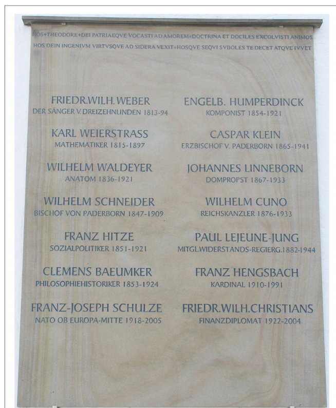
FIGURE 1 | Memorial tablet of famous alumni of the Gymnasium Theodorianum, Paderborn.

pelvic viscera. Many of these are actual pioneer works. The terms “Waldeyer’s fascia” and “Waldeyer’s lymphatic ring” are still found today in practically every textbook of anatomy. He coined the phrases “chromosome” and “neuron” with their anatomical-morphological concepts. Numerous terms which are less common today are associated with his name: he systemized the labels of the appendix testes [Paradidymis/Giraldé’s Organ, Appendix testis and epididymidis, among others (6)], the “Waldeyer White Line” refers to the line connecting the ovary with the peritoneum, the “Waldeyer-Tract” refers to the “dorsolateral fasciculus” on the spinal cord (also known as: Lissauer bundle), “Waldeyer’s fossa” describes a recess which is occasionally found behind the superior mesenteric artery in the region of the mesenteric root (2, 7, 8), the “Waldeyer sheath” which is the tubular space between the bladder wall and the intra-mural part of the ureter. His memoirs appeared in 1920 [Figures 2 and 3; (3)].