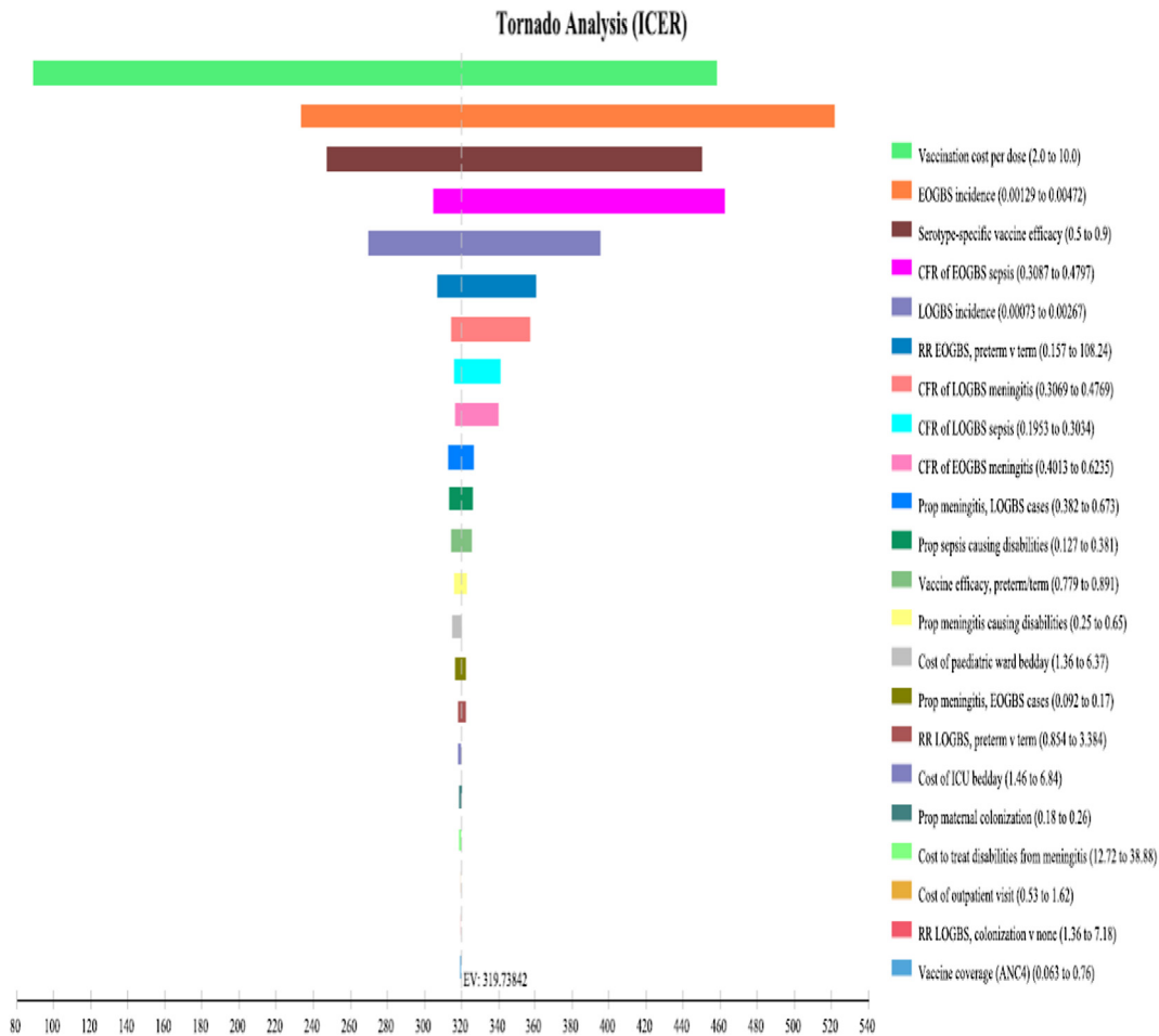
Fig. 1. Tornado diagram for Guinea-Bissau. The diagram shows the cost-effectiveness ratio (Cost/DALY) on the horizontal axis with the base-case ratio, $319, indicated by the dashed vertical line. Each horizontal bar shows how Cost/DALY varies around the base-case ratio as that parameter varies across its range (shown in Table 1), while all other parameters are held at their base-case values.

Uganda; $432 in Nigeria; and $382 in Ghana. Uganda's cost/DALY went down because the assumed case fatality ratios used were so much higher than those observed in Uganda.