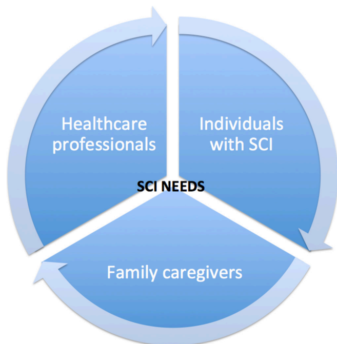
Figure 2 Integrative approach towards SCI needs.

A health science librarian (JB) developed the search strategy for Ovid Medline (table 1) and had it peer reviewed by another librarian per the PRESS standard. 55 As health system issues often change with models of care delivery, the economic climate, and the environment, we have decided to narrow the scope to the past 20 years (1997 to present). This search strategy will be adapted for subsequent databases. The following databases will be searched with no language limits applied: Ovid Medline,