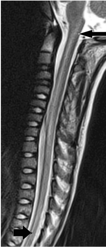
Figure 2 - T2 weighted sagittal MRI spine shows long segment transverse myelitis from C1 to T7 level. (arrows)

LETM to be the most common form of ITM in this region. Eighteen cases out of 19 (94.7%) had LETM. Several reports observed that the LETM was typically seen in children with ADEM. 1,6,7 However none of our LETM had features of ADEM, though such an association of LETM was seen in children with ADEM, a separate group reported earlier. 8 All the children did not undergo CSF examination. The study was allowed in 11 cases only. In this country performing a lumbar puncture still has social restrictions. CSF features were typical of idiopathic transverse myelitis in all.