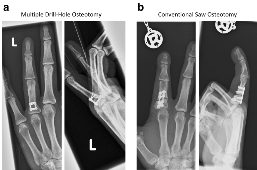
Fig. 3 Comparison of Multiple Drill-Hole osteotomy (a) and conventional saw osteotomy (b). Pat. #7 treated with MDH osteotomy, at follow-up 3 months post-operative with good bony consolidation (a) compared to a patient treated with saw-osteotomy, radiographic study 3 months post-operative (b)

This small, retrospective case series had some limitations. We could not provide proof that MDH osteotomies were superior to osteotomies performed with oscillating saws, due to the study design. Future prospective clinical trials would be required to address this question. However, given the small patient numbers, in