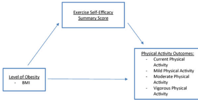
Figure 2. Theoretical Model of Obesity, Exercise Self-Efficacy, and Physical Activity Outcomes (OEP).