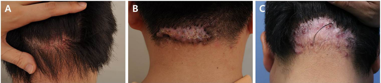
Fig 2. Clinical features of acne keloidalis nuchae (AKN) in 17 Korean patients. Follicular papules progressed to keloidal plaques with loss of hair. (a) 20-year-old man developed a lesion 3 months ago. (b) 26-year-old man developed a lesion 2 years ago. (c) 54-year-old man developed a lesion 13 years ago.

https://doi.org/10.1371/journal.pone.0189790.g002