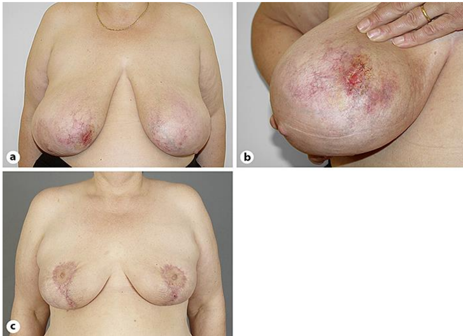
Fig. 1. Diffuse dermal angiomatosis of the breast. a Reticulated erythematous to violaceous patches involving both breasts, with ulceration on the right side. b Detail with prominent vessels surrounding the lesion. c Follow-up 4.5 months after bilateral reduction mammoplasty with no recurrence of the condition.