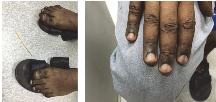
FIGURE 1: Marked hyperpigmentation over the knuckle pads (interphalangeal joints) and (periungual areas) of the hands and feet.