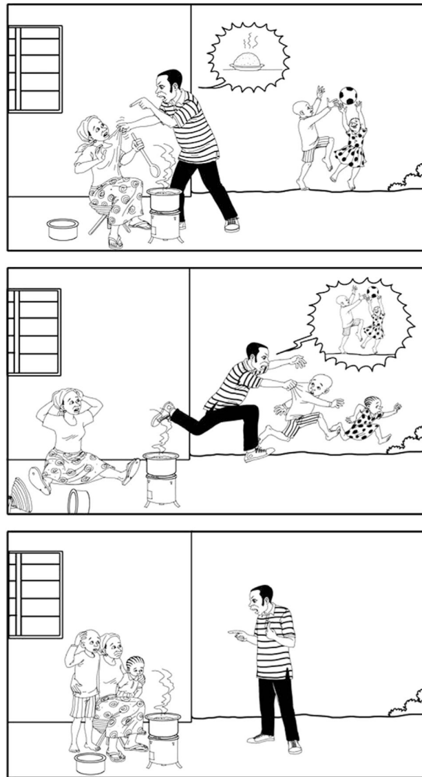
Fig. 1. FGD Vignette-1 (Illustrator: Marco Tibasima).