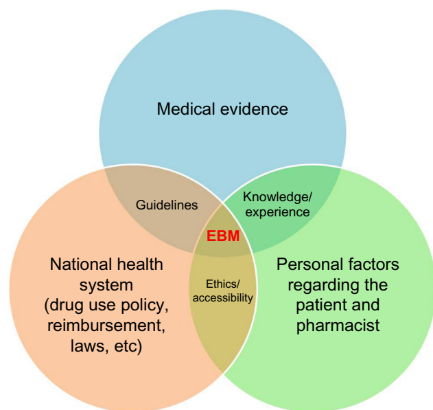
Figure 2 A decision-making process to establish a clinical treatment plan according to medical evidence that is compatible with national health policy and patient factors.

Abbreviation: EBM, evidence-based medicine.