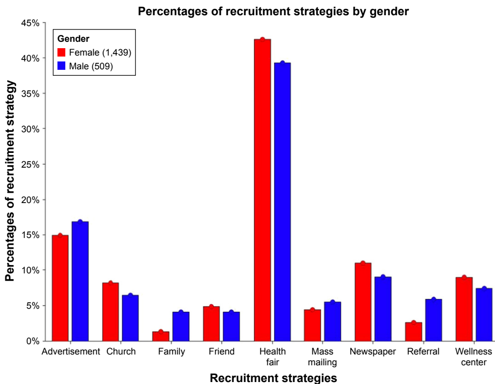
Figure 2 Gender-based distribution of strategies used to engage the community in the sample.

family referral sources is a new and important addition to the literature. Several strategies have been previously employed, but with limited success. In one study, distributing flyers to community clinics, physician offices, churches, and barber-shops serving older Black men failed to increase enrollment. This suggests that other strategies must be employed. 32 However, an alternative approach that employed the concept of a trusted source included ~1,003 Black churches, each setting a recruitment goal based on church attendance. Serving as recruiters, a pastor and a church member shared study information with the congregation and received monetary