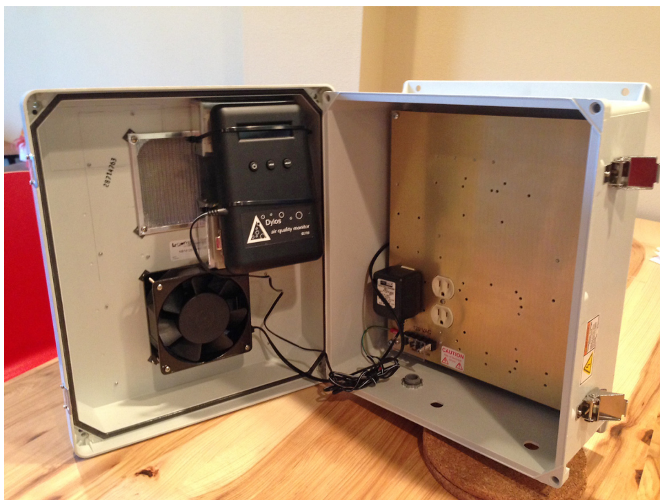
Figure 2. Air monitor system including modified Dylos particle sensor with four size bins ( >0.5 \mu\text{m} , >1.0 \mu\text{m} , >2.5 \mu\text{m} and >10 \mu\text{m} ), temperature and relative humidity sensors, and a microcontroller.

may include actions such as outreach to school communities about air quality and health; devising plans for schools to shelter in place during a poor-air-quality days, especially for students with asthma; sharing data trends with local officials to advocate for regulatory action; and training schools with a community monitor to use a flag system to notify the school community about the current air-quality level.