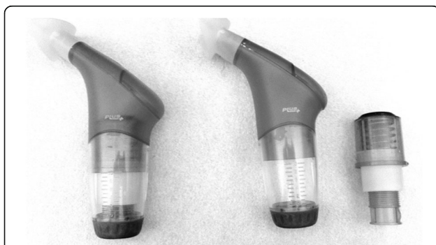
Fig. 1 Powerbreathe® Plus calibrated to a high load to the inspiratory muscle training group and unloaded for sham inspiratory muscle training group

The sample characterisation relied on demographical (sex, age), clinical, and functional data. The clinical and functional data comprised cause of hospital admission and illness severity measured by the Acute Physiology and Chronic Health Evaluation (APACHE) score [4]. The Barthel Index and Functional Independence Measure (FIM) were used to assess functional status. The modified Barthel Index is an ordinal scale that provides a total score of 0–100, where higher scores indicate greater independence [26]. The FIM is a scale with an 18-item, seven-level ordinal scale, with 1 indicating dependence and 7 indicating independence [27]. Before the study, each