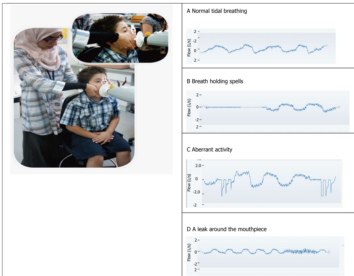
Figure 2 Demonstration of lung function measurements using FOT. On the left, a photograph of the FOT test being performed in a 5-year-old boy. The hands of the investigator support the cheeks and the floor of the mouth of the child. The nose is blocked using a nose clip. The lips are sealed around the mouthpiece. On the right, Different breathing patterns during FOT measurements are shown, as observed on the flow-time trace in L/s. A: Normal tidal breathing; B: Breath holding spells; C: An aberrant activity (e.g., coughing, swallowing, or noise); D: A leak around the mouthpiece. FOT: Forced oscillation technique.