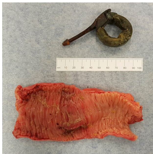
Figure 4 Resected portion of small bowel with gastric band.