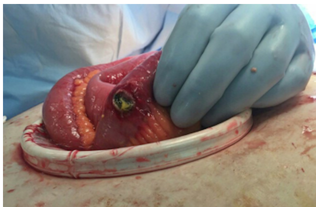
Figure 3 Intraoperative image. Perforation of ileum on view.

A 6 cm midline laparotomy was then performed with the assistance of a small Alexis O Wound Retractor (Applied Medical Resource, California, USA). During surgery, there was small amount of serous fluid with signs of enteric contamination. The small bowel was thoroughly inspected from duodenojejunal flexure to the ileocaecal valve. The gastric band was identified in the lumen of midileum protruding through the intestinal wall (figure 3). A length of 150 mm of ileum containing gastric band and perforation was resected (figure 4). A stapled side-to-side, functional end-to-end anastomosis was performed using GIA 80 blue (Covidien, Mansfield, Massachusetts, USA). The lap band port was removed along with attached tubing.