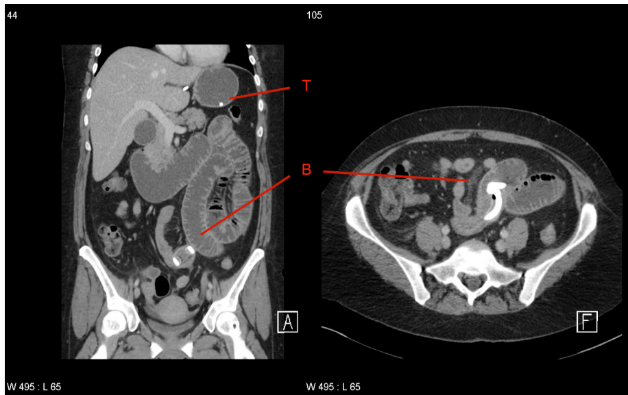
Figure 2 CT scan of abdomen and pelvis on admission; line B indicates laparoscopic adjustable gastric band in lumen of small bowel; line T indicates tip of connecting tube on gastric fundus.

marked dilatation of the stomach, duodenum, jejunum and proximal ileal loops which were fluid filled (figure 2). A transition point indicating mechanical obstruction was identified in midline at the level of pelvic brim where there was the dislodged gastric band with attached tubing within the lumen of a loop of ileum. Bowel distal to the point of obstruction was collapsed as expected. The gastric band access port was at its normal position in the anterior subcutaneous tissues and the tip of the fractured connecting tube passed through the gastric wall at the lesser curvature just below the gastro-oesophageal junction and was located within the gastric fundus (figure 2). There was no focal collection adjacent to the stomach at the site of tubing perforation. Only a small amount of free fluid was present in the pelvis and there was no pneumoperitoneum.