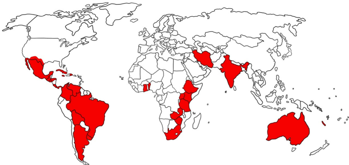
Fig. 2 Geographic distribution of acaricide resistance in Rhipicephalus ticks worldwide ( R. microplus : the USA, Mexico, Jamaica, Republica Dominicana, Cuba, Guatemala, Honduras, El Salvador, Panama, Costa Rica, Colombia, Venezuela, Bolivia, Uruguay, Brazil, Argentina, Australia, New Caledonia, India, Ira, Benin, Tanzania, South Africa and

verbutin concentrations potentiates the action of permethrin, coumaphos and amitraz. The verbutin demonstrated greater synergism than PBO to control R. microplus larvae resistant to coumaphos (synergism index (SI) = 1.5–6.0 vs. 0.9–1.6) and amitraz (SI = 1.8–1.5 vs. 0.9–2.5), but similar synergism for permethrin (SI = 2.1–4.4 vs. 2.1–3.6). Rodriguez-Vivas et al. (2013) evaluated the efficacy of cypermethrin, amitraz and PBO mixtures, through in vitro laboratory bioassays and in vivo on-animal efficacy trials, for the control of resistant R. microplus on cattle in the Mexican tropics. The authors showed that the mixture of cypermethrin + amitraz + PBO