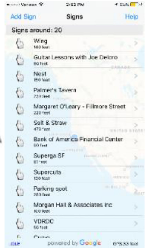
Figure 1. (a) overTHERE app icon. (b) App screenshot showing list of nearby signs.