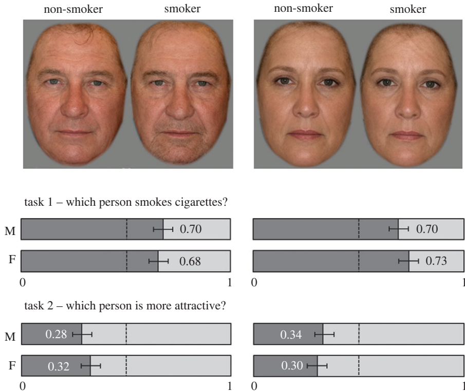
Figure 4. Mean judgements of smoking status and attractiveness in male and female prototypes from male (M) and female (F) participants. Responses were coded as non-smoker = 0, smoker = 1. Dotted vertical shows 0.5 level. Error bars are 95% binomial confidence intervals.

Participants were able to correctly identify which prototypes were formed from smokers, suggesting facial appearance provides some information about smoking status. Non-smoking prototype faces formed from the faces of non-smoking identical twins were judged more attractive than smoking prototype faces formed using the smoking twin siblings. This provides evidence that, while there will be some individual variation, the faces of people that smoke may age in a less attractive manner than those that do not.