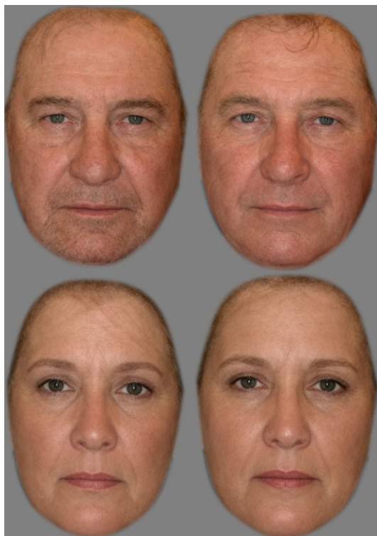
Figure 1. Prototype male (top) and female (bottom) smoking (left) and non-smoking (right) faces.

They responded by clicking or touching one of the faces. The faces remained on screen until the participant responded. Each task took approximately 5 min to complete, after which they were returned to Prolific Academic and reimbursed £0.50.