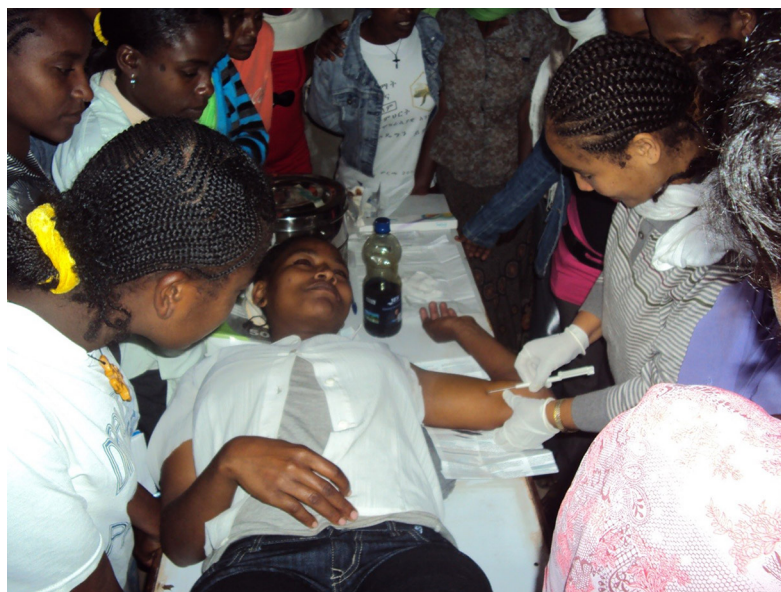
Under the supervision of an instructor, a Health Extension Worker inserts an Implanon implant in a client during training, as other trainees watch the procedure.

rollout training session. Both the TOT and the rollout trainings were conducted in accordance with the national Implanon curriculum, as instructed by the FMOH. Recognizing the critical importance of comprehensive family planning counseling, this curriculum includes instruction