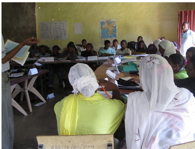
Health Extension Workers learn about Implanon during a theoretical training session.

Abbreviations: FMOH, Federal Ministry of Health; HEWs, Health Extension Workers.