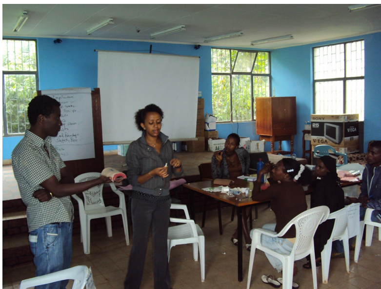
An instructor simulates Implanon insertion on an arm model to Health Extension Workers during a training session.

trainers conducted a series of rollout trainings with HEWs.