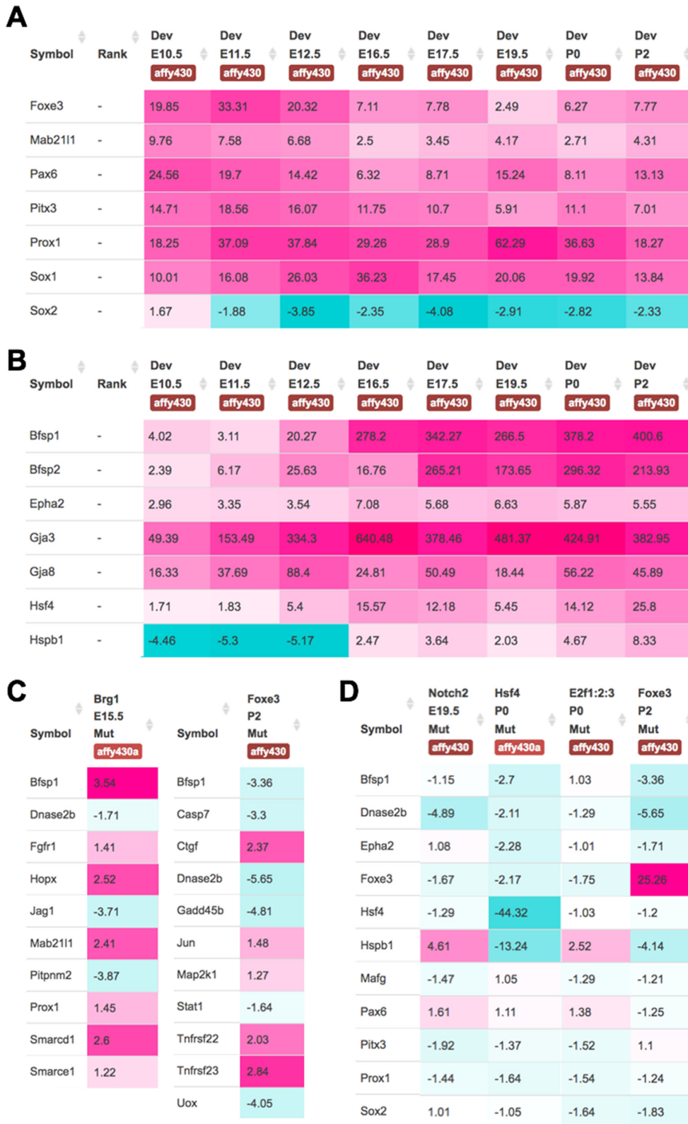
Figure 2. iSyTE 2.0 allows effective visualization of normal and perturbed lens expression data. (A) Expression of lens regulators in different lens stages. At early lens development stages E10.5 Sox2 is enriched in the lens, but with the commencement of primary fiber cell differentiation at E11.5, it ceases to be lens-enriched while Sox1 becomes progressively lens-enriched. (B) Fiber differentiation associated genes that get sharply lens-enriched between E12.5 and E16.5 stages. (C) Differentially expressed genes in the Foxe3 overexpression and the Brg1 dominant-negative mutant lens. (D) Differential gene expression in Notch2 , Hsf4 , E2f1:E2f2:E2f3 and the Foxe3 mouse mutant lenses. Note: Hspb1 ( Hsp27 ) is markedly downregulated in Hsf4 and Foxe3 mutants but upregulated in Notch2 and E2f1:E2f2:E2f3 mutants, among other differences in misregulated genes. It is also noteworthy that Foxe3 is 25-fold upregulated in the Foxe3 overexpression mutant while Hsf4 shows a 44-fold downregulation in the Hsf4 deletion mutant, indicating that iSyTE 2.0 meta-analysis has worked well.