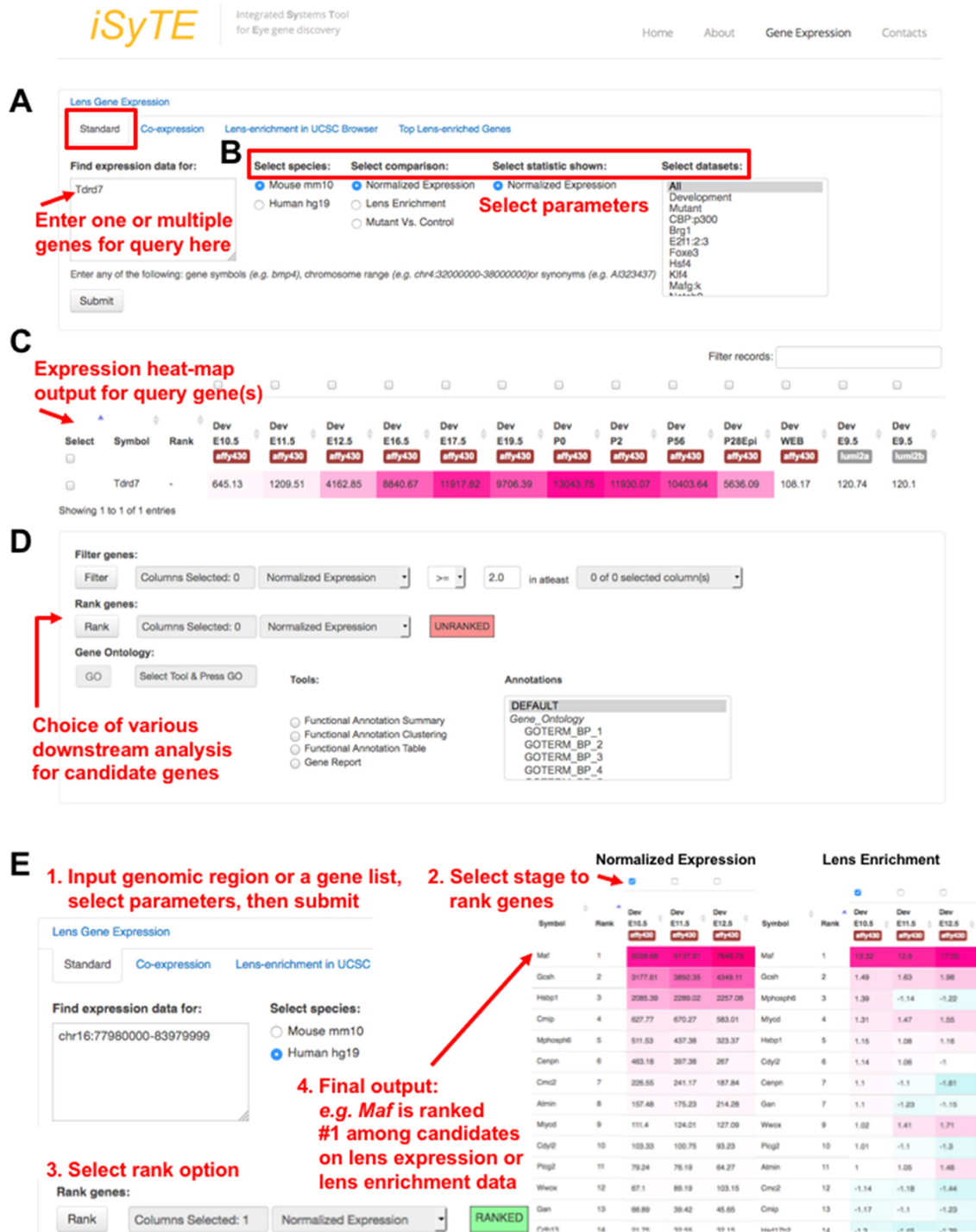
Figure 1. A new web-interface for iSyTE 2.0 database. (A) The fully analyzed Affymetrix Mouse 430 2.0 and Illumina MouseWG-6 v2.0 gene expression data from embryonic, postnatal lens developmental stages can be accessed under the tab 'Lens Gene Expression' on the iSyTE 2.0 web interface. For investigating the expression of candidate gene(s), under 'Standard', we developed a search portal called 'Find expression data for' where the user submits the gene query. (B) The query can be analyzed using specific parameters on the right as follows: (i) select the species (Mouse mm10 or Human hg19 assembly), (ii) select the type of comparison between the choices of (a) normalized expression, (b) lens enrichment and (c) mutant versus control, (iii) select the statistic appropriate for the comparison (e.g. for 'lens enrichment' the statistic choices offered are 'fold change', 't-stat' or 'P-value') and (iv) selects the appropriate dataset (e.g. selecting 'Developmental' will show all normal lens expression data while selecting 'Mutants' will show all mutant lens expression data in fold-change; selection of specific mutants such as Brg1 is also an option), before submitting for analysis. (C) The output for the query gene(s) is provided as an expression heat-map for different mouse developmental stages. (D) iSyTE 2.0 offers various downstream analysis such as 'Filter', 'Rank' and 'GO' analysis via DAVID on selected genes. (E) In the following example, the 'Rank' feature is described. In an investigation of 14 candidate genes from an ~6 Mb genomic region (chr16:77980000-83979999), iSyTE 2.0 lens expression or enrichment (fold change) correctly ranks the gene MAF as the top candidate, which is the causative gene linked to human congenital cataract. Additionally, tabs for other analysis/resources such as 'Co-expression', 'Lens-enrichment in UCSC Brower' and 'Top Lens-enriched Genes' are accessible under 'Lens Gene Expression'.