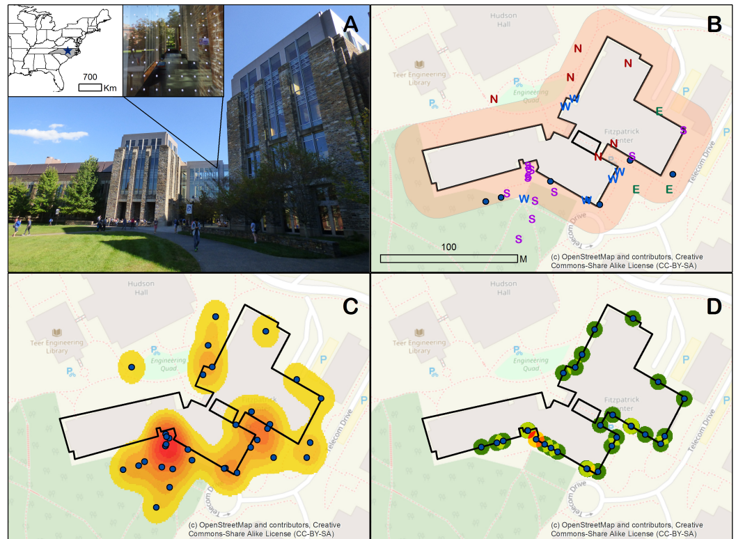
Figure 1 Understanding bird-window collisions at the Fitzpatrick Center building at Duke University, North Carolina USA. (A) Insets show the location of Duke University, and bird-friendly pattern of dots applied to some windows. (B) Reported cardinal directions of impacted building faces (with a 20-m buffer displayed); dots represent observations for which no data or letters other than N, E, S or W were entered. (C) A kernel density function of mapped collision points. (D) Collision observations snapped to the building perimeter and treated with a point density function.