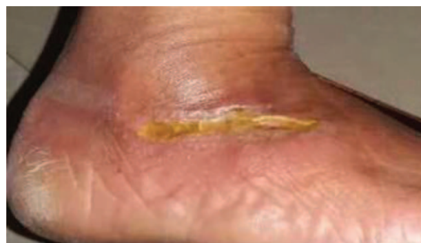
Figure 3. Wound almost healed 3 weeks after treatment with placenta-derived mesenchymal stem cells hydrogel.

MSCs are multipotent stromal cells that were first found in bone marrow by Friedenstein et al [20] in 1966. They were later found in various other tissue types, including umbilical cord blood, placenta, [10,21,22] adipose tissue, and amniotic membrane. It is important to establish the best cell source. Currently, bone marrow is the main cell source of MSCs, whereas the human placenta is a better choice. First, PDMSCs are readily acquired and raise no ethical conflicts. Second, and most importantly, larger amounts of cells can be isolated from human placenta compared with bone marrow. Third, human placenta displays lower immunogenicity. [9-11] The main component of PDMSCs hydrogel is placenta-derived MSCs, combined with sodium alginate powder. Specifically, the sodium alginate powder can be adopted to maintain the activity and cellular compatibility of PDMSCs. PDMSCs have multidirectional differentiation capacities and secretory capabilities that could improve wound