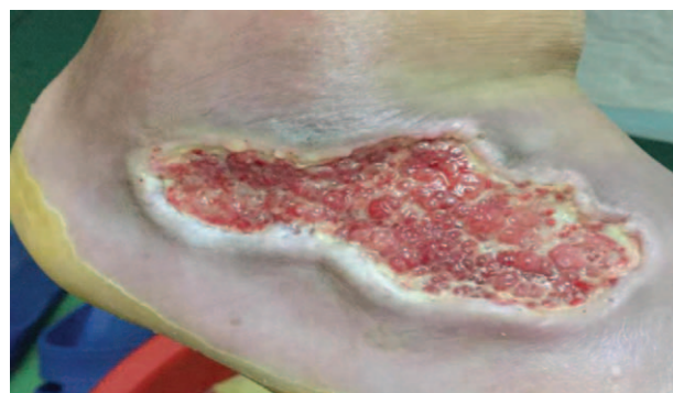
Figure 2. Right dorsum pedis wound 72 h after treatment with placenta-derived mesenchymal stem cells hydrogel, showing clearly decreased purulent secretions and wound size.

During the follow-up visit in the subsequent 6 months, the patient had no relapse. The patient was advised on a special diabetic diet, and a record was made of regular treatment and investigation for diabetes. A pair of soft cotton shoes was made for the patient’s feet. Health education included on DM and diabetic foot, including among others avoiding force on or wounding of the impaired limb, foot care in diabetes, and reducing physical activities.