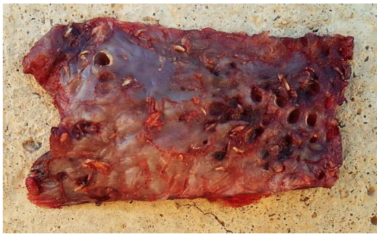
Fig. 2. Gasterophilus larvae on the esophageal mucosal membrane of an onager