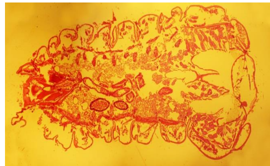
Fig. 3. Cross-sections Gasterophilus larvae (10x), H and E