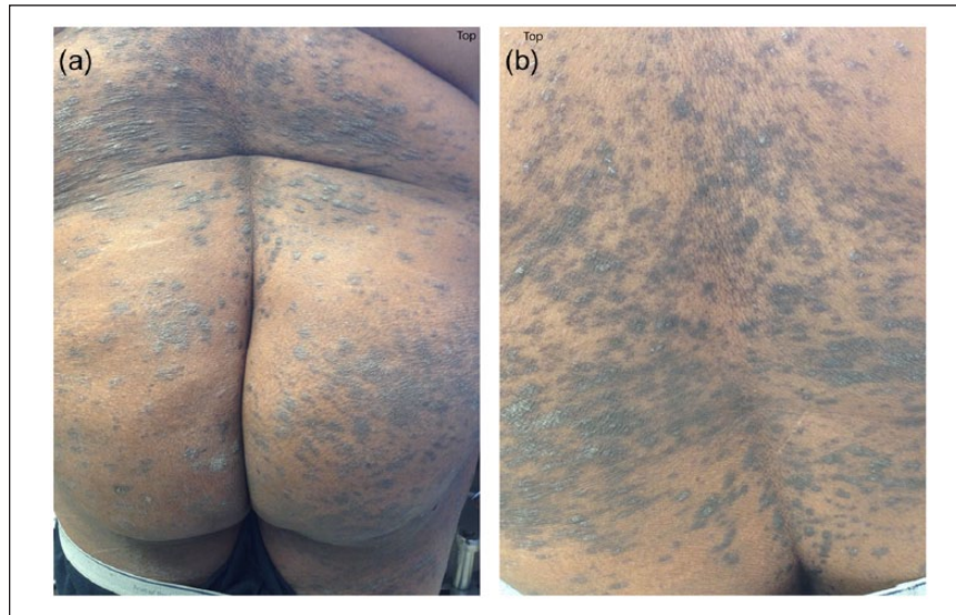
Figure 1. Discrete and coalescing polygonal-shaped, violaceous, flat-topped papules located on the trunk and extremities: (a) and (b) some lesions have a network of fine white lines, “Wickham striae.”