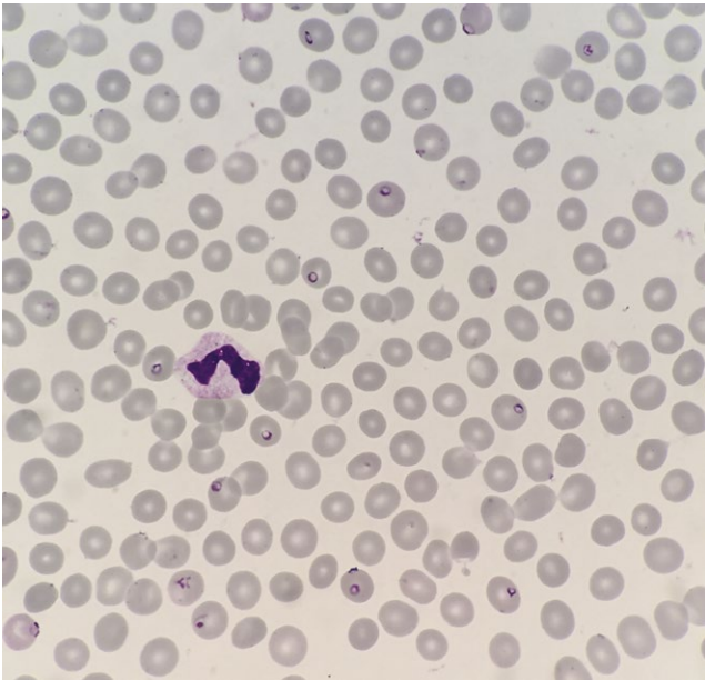
FIGURE 1 Microscopic image of thin films showing Plasmodium falciparum parasitemia index of 5.4%

increase in his parasitemia index to 8.6%, it decreased to <0.1% on hospital day 3. Intravenous quinine was replaced with artemether/lumefantrine and was continued for 3 days. He recovered fully and was discharged on hospital day 10.