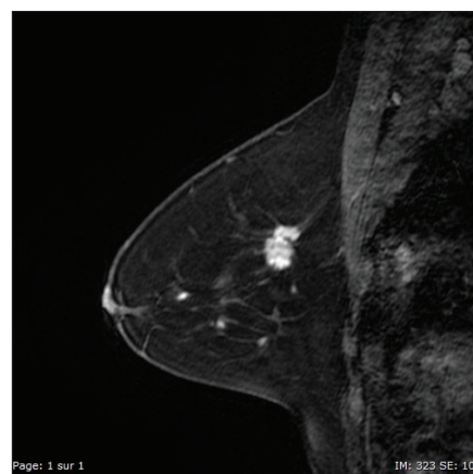
Figure 1. Sagittal VIBRANT® image of an invasive breast carcinoma.

Two radiologists (a junior physician with 6 months of breast MRI experience, and a senior physician with 5 years of experience) individually reviewed the images in two stages separated by at least two weeks with randomization so as to limit all bias. Abbreviated and complete protocols were mixed in the two stages. For both stages, the readers had access to the previous examinations and clinical information, but not to the later examinations, current breast MRI report, and later possible anatomopathology analysis or imaging follow-up. For every reader, the order of the two stages was randomized and the reading of the abbreviated protocol was blinded from the reading of the complete protocol. For each breast, the readers indicated the size, the quadrant, the type of lesion in case of anomaly, and the ACR BI-RADS classification. The duration of read outs were also noted. The BI-RADS classifications were then compiled according to the implication