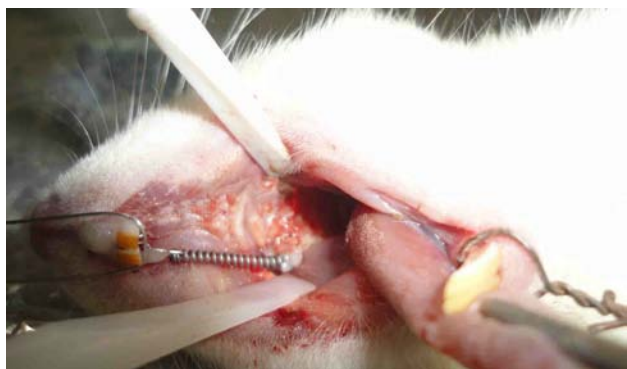
Figure 2. Intraoral view of orthodontic appliance which place between first molar and central incisors.

feeler gauge, FENGHGO) with 0.05 mm accuracy. The mean of the three measurements was reported as the final value.