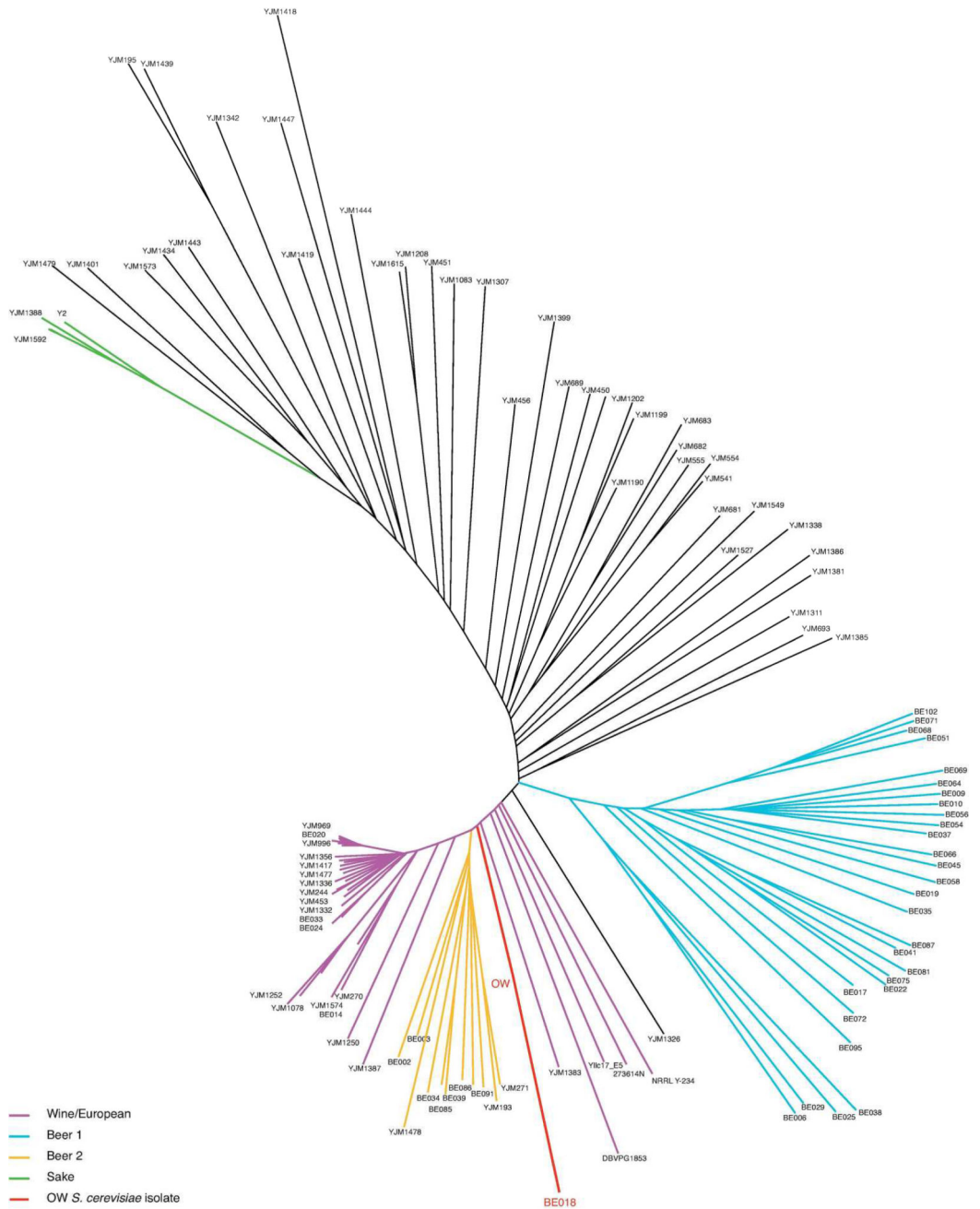
Figure 3. Phylogeny of S. cerevisiae Neighbor-joining tree of S. cerevisiae strains representative of the species diversity (Strope et al. 2015; Gallone et al. 2016) and OW (for Old Warehouse) S. cerevisiae strain (red).