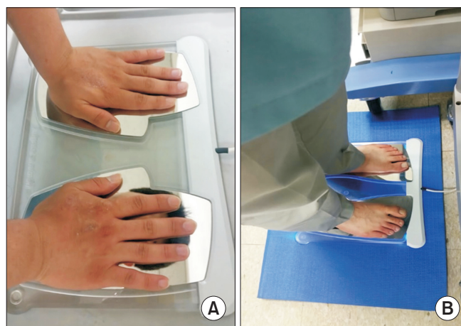
Fig. 2. Position of a subject undergoing a typical SUDOSCAN examination performed in standing position with full contact of electrodes on the hands (A) and the feet (B).

NCS was performed with a Viking Electromyography System (Nicolet-Viasys Biomedical Inc., Madison, WI, USA) with a setting of 20 Hz for the lower filter, 3 kHz for upper filter for sensory studies, and 5-10 kHz for motor studies. The pulse duration was with 0.1 ms. NCS tests included the sural sensory, superficial peroneal sensory, common peroneal motor, and tibial motor nerves. The minimum F-response latencies from both tibial nerves and H-reflex latencies from tibial nerve stimulation were collected. EMG needling was done by inserting the monopolar needle in selected lower extremity muscles and lumbar paraspinalis muscles from the L1-L2 to L5-S1 levels. All NCS and EMG tests were performed by experienced physicians with more than 3 years experience in the procedures. NCS results obtained from only one side