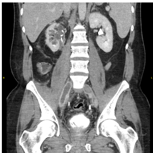
Figure 3 CT venography. CT imaging demonstrating bilateral common iliac vein thrombi as hypodense occlusive masses with vein wall enhancement and dilatation. This thrombus extended far into the inferior vena cava. CT, computed tomography.

Contrast media is injected and serial radiographs are taken to visualize the deep venous system of the leg. A persistent filling defect in multiple views is considered diagnostic for DVT (35) ( Figure 2 ). In CT venography, contrast media is injected into the arm and imaging is timed with opacification