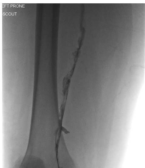
Figure 2 Contrast venography. Angiogram imaging of the left popliteal vein demonstrating a partially occlusive thrombus with irregular margins and diminished contrast flow. This thrombus was subsequently treated with catheter directed therapy.