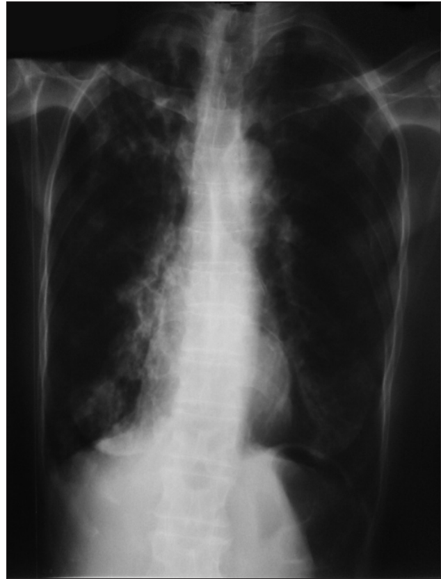
Figure 3. Patient's chest X-ray after 6 th month treatment

The lungs are easily affected by inhalation of aerosolized mycobacteria and is by far the most frequent site of human mycobacteriosis. In HIV(+) patients, the disease is indistinguishable from tuberculosis and is characterized by a very slow progression [6]. Cavitory NTM pulmonary disease is radiographically and clinically indistinguishable from pulmonary tuberculosis. Manifestations range from absence of