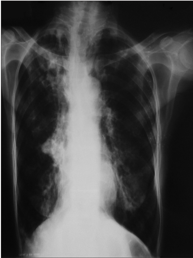
Figure 1. Patient's chest X-ray before treatment