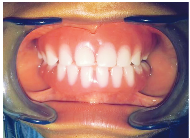
Fig. 5: Denture seated in patient's mouth

Home care instructions were given, which included removal of the dentures at night and brushing both dentures and natural teeth after every meal. Since follow-up care is very important, patient is recalled on a regular basis for oral examination, dental prophylaxis, oral hygiene instructions, and denture adjustments, if necessary.