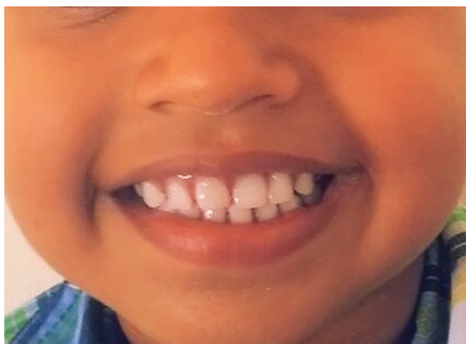
Fig. 6: Posttreatment view with a confidently smiling patient