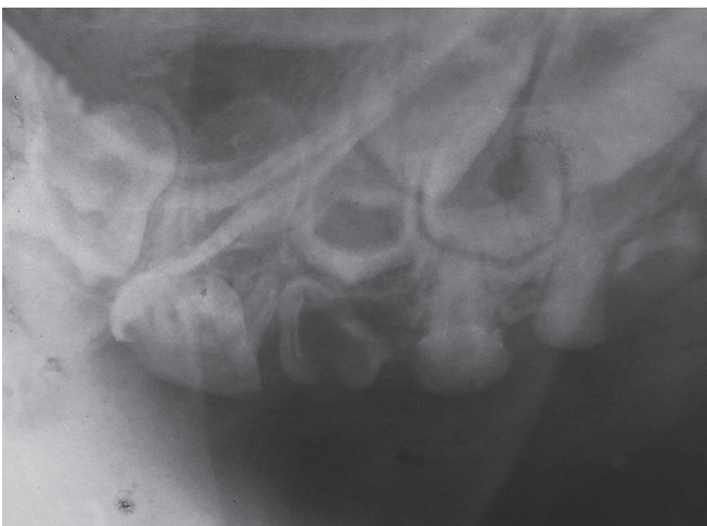
Fig. 4: Intraoral periapical X-ray of upper right quadrant with marked cervical constriction and pulpal obliteration in deciduous teeth

Voice control, distraction, tell-show-do technique, and positive reinforcement were the behavior-modification techniques employed for managing the patient.