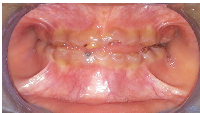
Fig. 2: Pretreatment intraoral view with severely attrited teeth

On clinical examination, the child had typical appearance of an edentulous person with loss of vertical dimension, decreased lower facial height, prognathic facial profile, and loss of upper and lower lip support. On intraoral examination, all the deciduous teeth were attrited to the level of the gingiva. The 54, 64, 81, 51, and 61 presented as root stumps with mobility of 54 and 64. All the teeth were yellow-brown in color and translucent (Fig. 2).