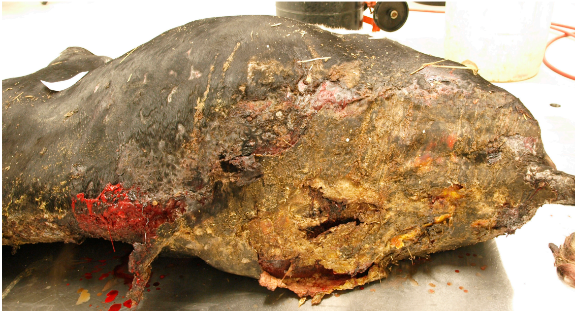
Figure 7. Holstein heifer with third degree burns to dorsum one month following a barn fire.

the farm and found the previously treated heifer with severe burns on the dorsum. The cow was administered a nonsteroidal anti-inflammatory drug and was shipped to a nearby veterinary referral centre. Upon arrival, the receiving veterinarian ordered immediate euthanasia of the heifer on the truck because of significant concerns about poor welfare and unrelieved pain and distress. At post-mortem, the heifer was noted to have extensive third degree burns and eschar covering approximately 60% of the dorsum (Figure 7).