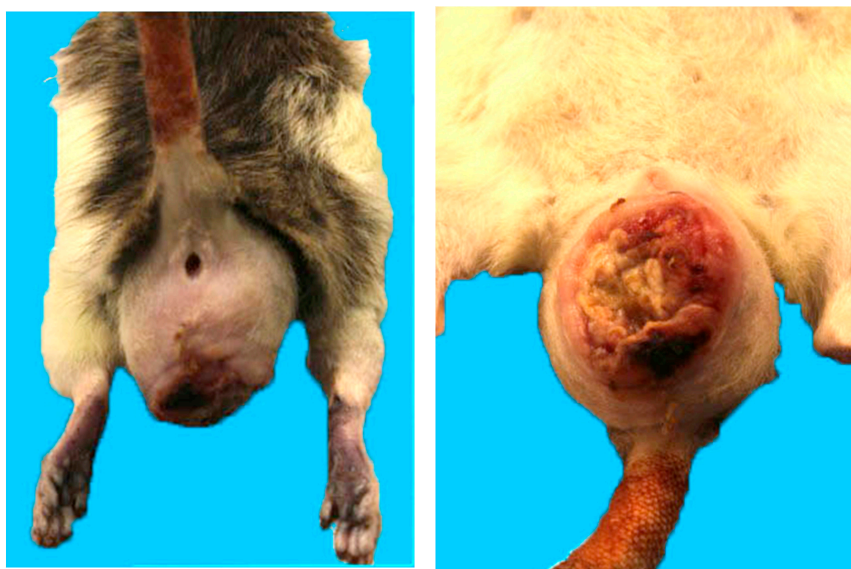
Figure 4. Dorsal view of a perineal mass in a mature female pet rat ( left ); Ventral view of ulcerated perineal mass in the same rat ( right ).

An aged female rat was presented to a newly hired veterinarian in an exotic animal clinic for a perineal mass that the client indicated had appeared only one week prior. Due to financial constraints, it was reported that the owners elected to pursue surgical debulking of the mass without further diagnostics. The owners brought the rat back to the veterinarian one month after the initial surgery, as the mass had regrown and had ulcerated (Figure 4). On physical examination, the rat was in poor body condition and had a large irregular perineal mass. Diagnostic testing was declined and the rat was euthanized. Subsequent post-mortem and microscopic follow-up indicated that the mass consisted of a rapidly growing and invasive vaginal leiomyosarcoma.