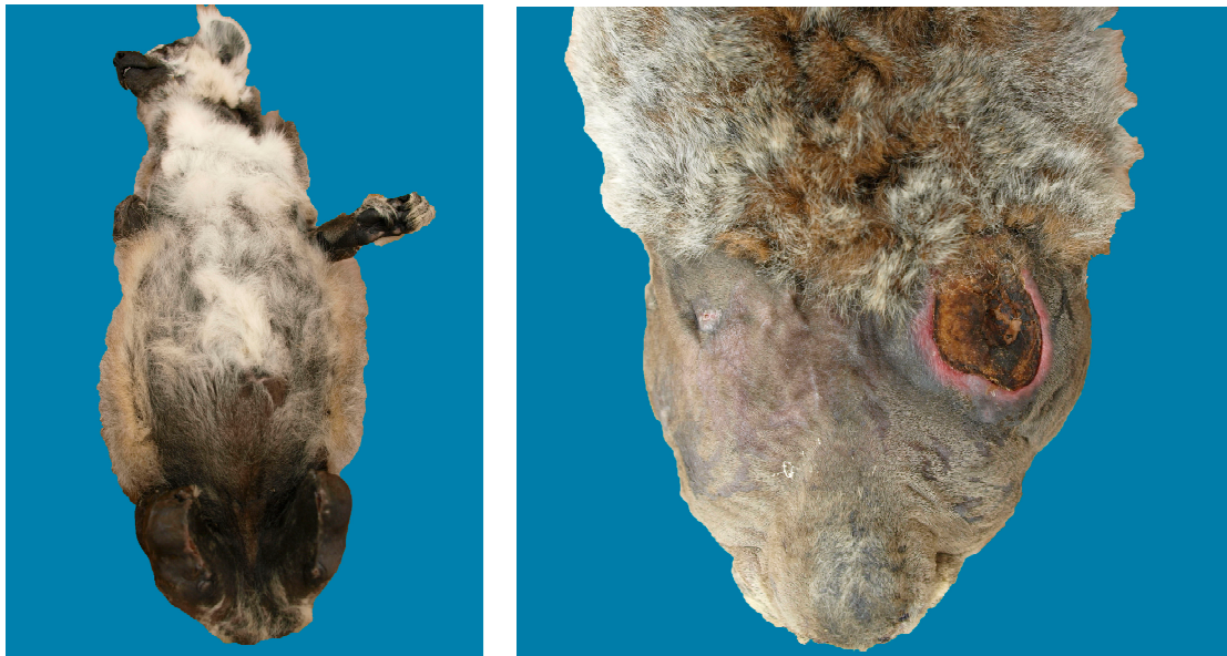
Figure 6. One-armed ring-tailed lemur presented for post-mortem examination ( left ); A deep suppurating ulcer was present on the dorsal trunk ( right ).