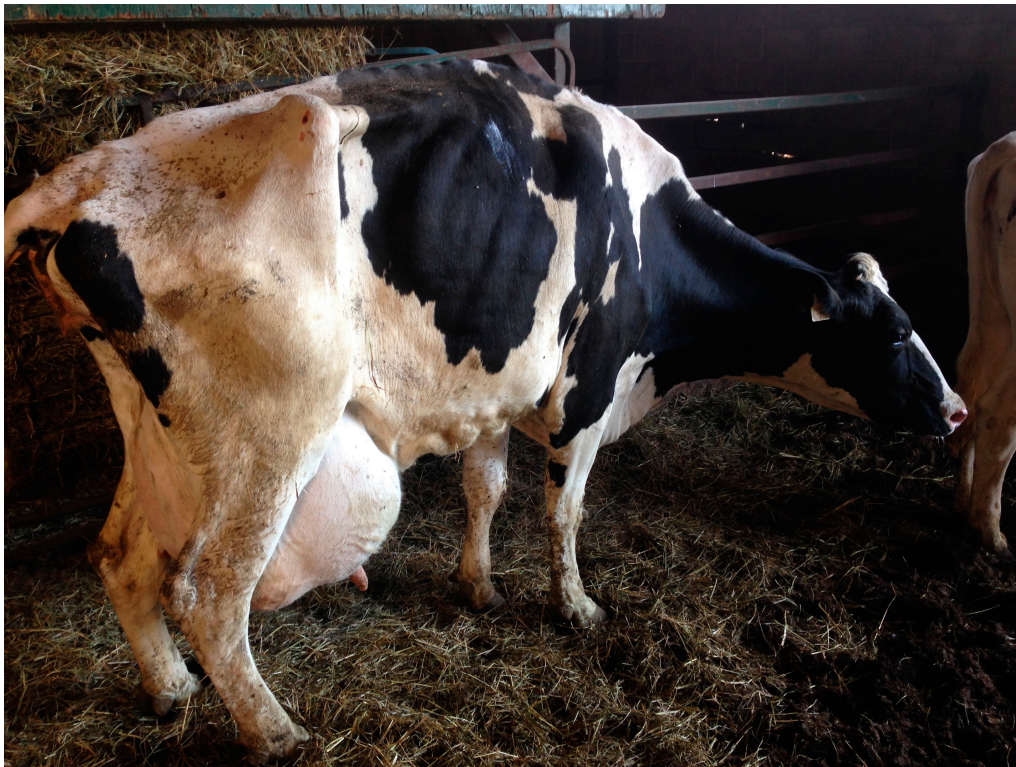
Figure 1. Severely lame dairy cow in very poor body condition presented at a livestock sales barn.

Livestock sales and their associated regulations are observed and enforced, respectively, by regulatory veterinarians with responsibilities for segregating, inspecting and making decisions about animals that arrive and are deemed to be compromised. In this case, the cow was unloaded at the sales barn and found to be severely lame and non-weight bearing on her right hind leg. The cow was segregated by sales barn staff for veterinary inspection. The regulatory veterinarian determined that the cow was dull, extremely thin, reluctant to move, unable to keep up with a group of conspecifics, moderately lame in her left hind and right front limbs with severe swelling of her right carpus and non-weight bearing in her right hind limb while standing. The cow was euthanized and submitted for post-mortem examination to investigate the cause of the lameness and to offer insight into the chronicity of any causative lesions. Post-mortem examination of this cow revealed severe, chronic bilateral digital dermatitis and marked heel horn erosion in the hind feet. Of note, digital dermatitis is part of a spectrum of, mostly treatable, hoof lesions in cattle [60].