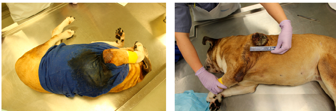
Figure 5. Lateral view of the dog with the t-shirt on demonstrating staining from the underlying necrotic mass (left). T-shirt removed and the large ulcerated mass revealed (right).

A 14-year-old spayed female American Bulldog was under the care of a veterinarian at a primary clinic for chronic osteoarthritis and a large ulcerated and necrotic cutaneous mass on the shoulder of many months duration. For reasons not specified in the history, the client and the veterinarian did not pursue biopsy or staging, or analgesia and instead, the client elected to cover the thorax with a t-shirt. The dog was referred to a tertiary care centre because the mass continued to 'split open' and ultimately, the dog was euthanized due to poor quality of life concerns. The dog was submitted for post-mortem examination and was noted to be wearing a blue t-shirt that was heavily stained with malodorous fluid (Figure 5). When the t-shirt was removed, a large and markedly necrotic mass was present within the skin and subcutaneous tissues of the left shoulder. Histologic examination identified this tumour as a grade II soft tissue sarcoma, with no evidence of metastatic disease. Degenerative joint disease was noted in the right coxofemoral joint and several other previously undiagnosed and unrelated tumours were detected in other organ systems.