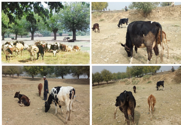
Fig. 2 Images of some of the animals treated with medicinal plants

The prevailing Indigenous ethnoveterinary knowledge in the study area is facing certain constraints leading it