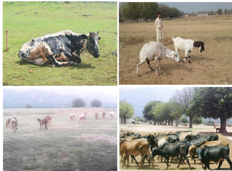
Fig. 3 Images of some of the animals treated with medicinal plants