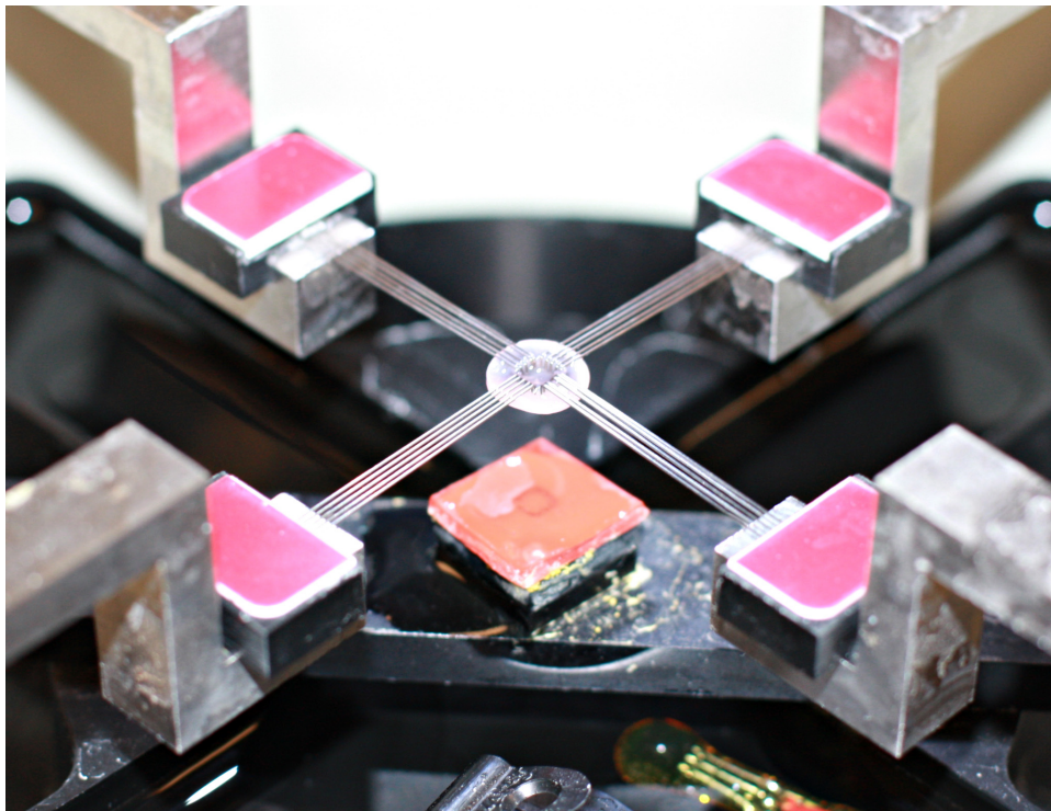
Figure 1 Fitting of the corneal specimen on the BioTester device rake battery just prior to testing.

For data evaluation, the following definitions have been adopted: strain, the unitless relative elongation ( \Delta x/l or \Delta y/l ), where ( l ) is the initial dimension of 3.5 mm, expressed as percentage and stress, a pressure metric, as the applied force F divided by the cross-section ( A ) of the corneal specimen test area ( F/A ) ( F/A , units = \text{mN}/\text{mm}^2 = \text{kPa} = 10^3 \text{ Pa} ; \text{MPa} = 10^6 \text{ Pa} , where Pa stands for Pascal, SI unit for pressure). Cross-section of the test area ( A ) was defined by 3.5 mm x - (or y -, respectively) width multiplied by the measured central corneal thickness. Stress at 10% and 15% strain was recorded.