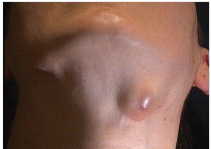
Figure 1. A female patient presenting with the complaint of neck swelling and diagnosed with tularemia

Twelve (48%) of the patients underwent abscess drainage under local anesthesia, three (12%) patients underwent mass excision operation under general anesthesia, and 10 (40%) patients received only medical treatment. The diagnoses of patients having undergone mass excision under general anesthesia were established with postoperative evaluation of tissue samples for tularemia. One patient re-applied with neck swelling in the third month after abscess drainage, and the patient was administered streptomycin and doxycycline therapy with aspiration. The mean duration of hospitalization was 5.47±1.77 days. Samples taken from 19 patients (76%) were sent for pathological examination; 13 patients (52%) were reported with cytological findings consistent with abscess content and six (24%) were reported as having granulomatous inflammatory reaction. In the examination of abscess material, 25 patients (100%)