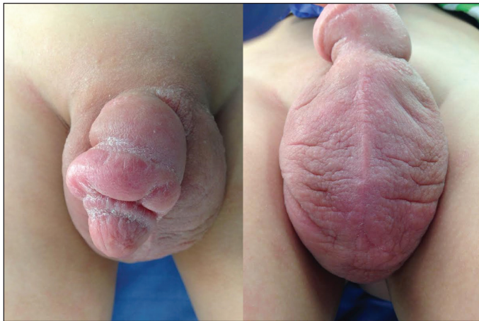
Fig. 1. Intraoperative appearance of scrotal and penile edema at time of biopsies.

and non-specific inflammation (contact dermatitis, balanoposthitis, peritonitis). 3,4 For chronic genital swelling, the differential also includes sarcoidosis, pyoderma gangrenosum, fungal or helminth infections, recurrent erysipelas, or pelvic neoplasms. 4