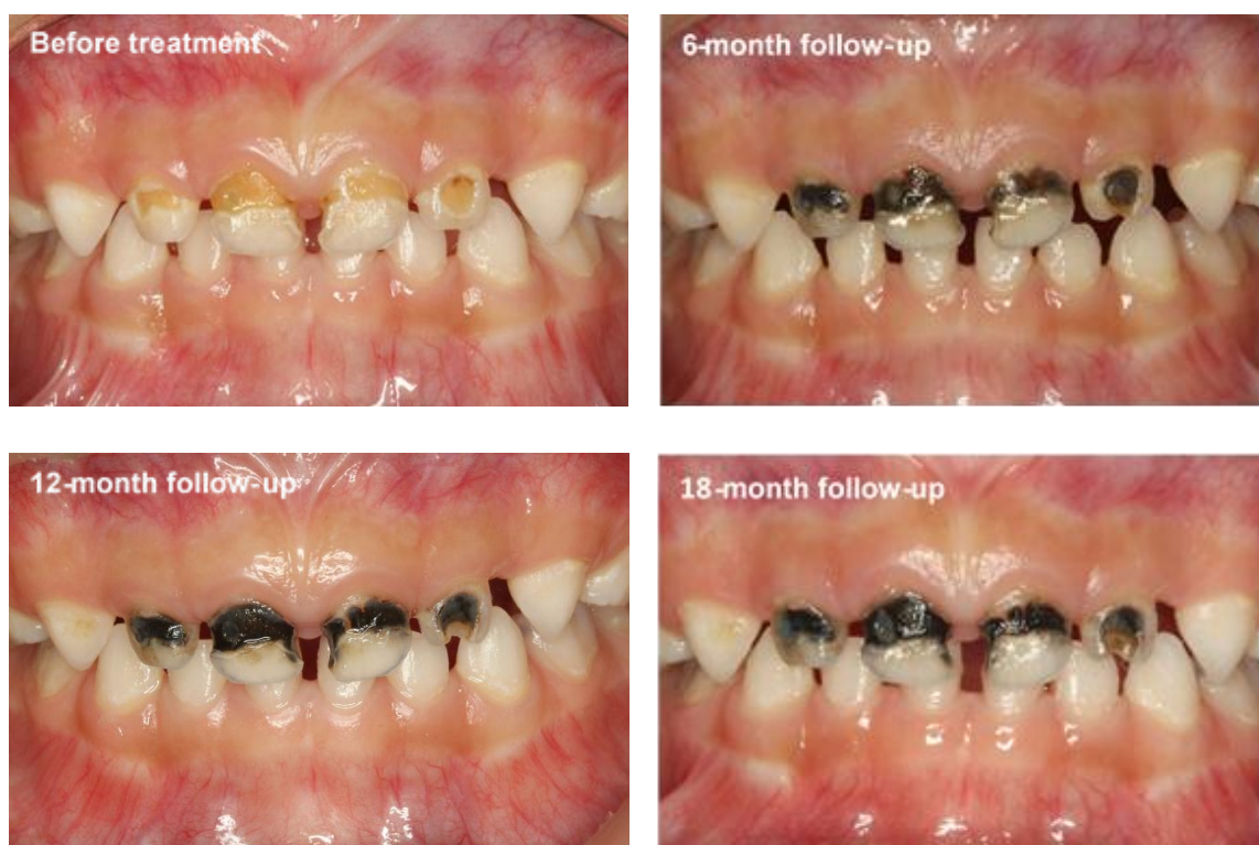
Figure 2. Dental caries before and after the application of 25% silver nitrate solution followed by 5% sodium fluoride varnish.

A double-blind randomised clinical trial was performed to compare the caries-arresting effect of the silver nitrate solution followed by sodium fluoride varnish protocol with that of silver diamine fluoride (SDF) [32]. More than 1000 kindergarten children aged 3–4 years with cavitated caries lesions were treated with the protocol or SDF (positive control) every six months. The 12-month results found no difference in caries-arresting effects between using the silver nitrate solution followed by sodium fluoride varnish protocol and using SDF [33]. Arrested caries lesions were stained black (Figure 2). No other significant side effect was observed. The study also found that the caries-arresting rate was influenced by the child's oral hygiene and the location of the caries surface.