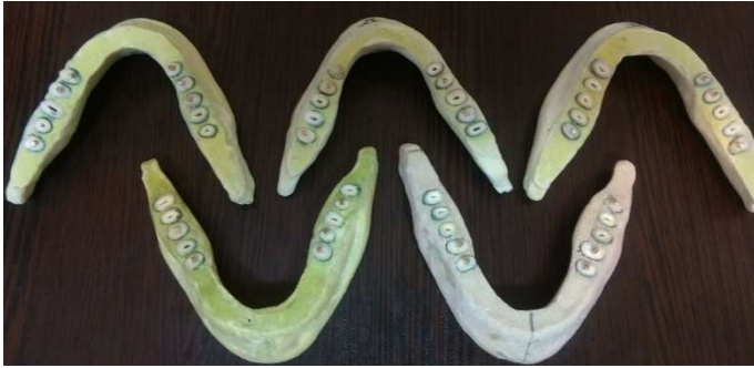
Figure 1. Arches with the same forms

Cone-beam computed tomography (CBCT) offers sub-millimeter resolution, short scanning times, low radiation dose, and three-dimensional (3D) illustrations that are reasons CBCT imaging is being widely used in dental diagnostics [6, 7]. Several investigations have evaluated the efficacy and value of CBCT in RF diagnosis [8, 9]. CBCT images had higher sensitivity and diagnostic efficiency for the detection of root fractures compared to intraoral radiography and multi-detector helical CT [10]. The CBCT method also has a high accuracy of VRF diagnosis [2, 11, 12].