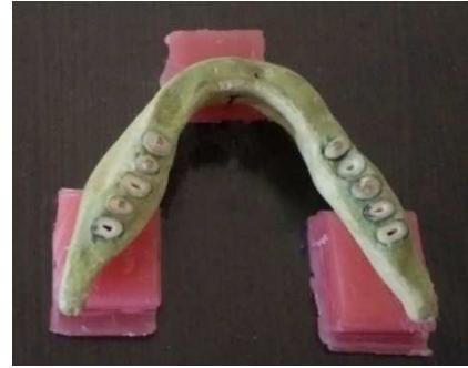
Figure 2. A fixed mandible model on a plexiglass sheet

Some CBCT machines, such as Pax-i3D (Vatech, Gyeonggi-do, Korea), have an option for MAR mode. Application of MAR to CBCT images could effectively reduce image noise when a phantom had a metal object [20, 21]. Application of MAR did not increase the diagnostic value of CBCT for detection of RF, but there are limited documents to confirm this finding [16, 22]. Thus, the purpose of this study was to evaluate the value of CBCT in RF diagnosis in endodontically treated teeth containing an intracanal post, with and without application of the MAR mode.