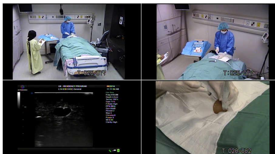
Fig. 1 The four camera views of the central venous catheterization procedure, from the foot of the bed ( upper left ), from the right showing the procedural tray ( upper right ), from the left showing the procedural site ( lower right ), and the ultrasound screen ( lower left )

Participants were assigned to two groups in this study. Due to accidental violations in the randomization procedure, the majority of the participants (85%) were not randomized but assigned using unconcealed alternating group assignment. In the control group, participants were interrupted during a task that was felt to be low in complexity: skin cleaning for the insertion site. In the experimental group, participants were interrupted during a more complex task: establishing venous access under direct ultrasound guidance, where the interruption occurred as soon as the venous access needle entered the simulated skin.