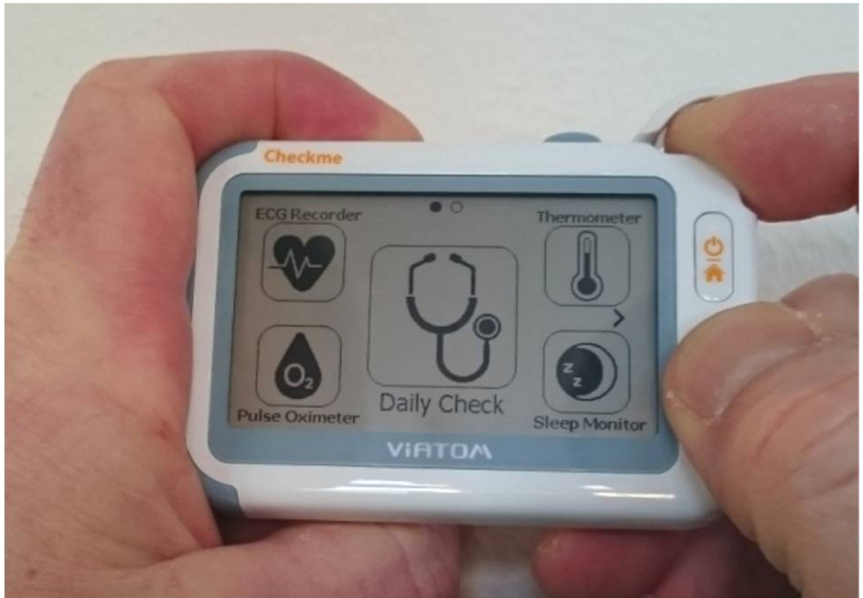
Fig 1. Viatom Checkme held in measuring position.

https://doi.org/10.1371/journal.pone.0190138.g001