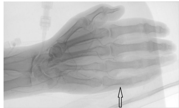
Fig. 2 Conventional angiogram of the left arm was performed five weeks after her second Ipilimumab infusion (end of week 26 on timeline). There is severely diminished flow in the digital arteries of the left hand beyond the level of all proximal interphalangeal joints (black arrow), consistent with small vessel occlusive disease

mediated vasculitis, the patient also received a 5-day course, 6-h per day, of Epoprostenol at a rate of 3 ng/kg/min. Fifty units of botulinum toxin A in 10 mL of normal saline was injected into each hand via palmar approach focusing on the proximal aspect of each digital artery. After six days of IV steroids, she was transitioned to oral Prednisone 100 mg (1 mg/kg) daily. She received four cycles of Rituximab at 375 mg/m 2 , at approximately one-week intervals. Her Prednisone was tapered to 10 mg daily over the course of seven weeks. She then developed an IRAE of pneumonitis, which quickly improved when the Prednisone was increased to 50 mg daily. During steroid treatment, she was also on Alendronate and calcium for osteoporosis prophylaxis, Bactrim for pneumocystis pneumonia prophylaxis, and Omeprazole for gastrointestinal protection.